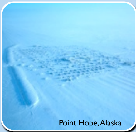
Point Hope, Alaska

We are glad to report that God has been at work in us and through us as we travel and spread word of what He is doing in the Yukon Flats region of Alaska! Thank you, God, for the safe travel and opportunities to share the vision!