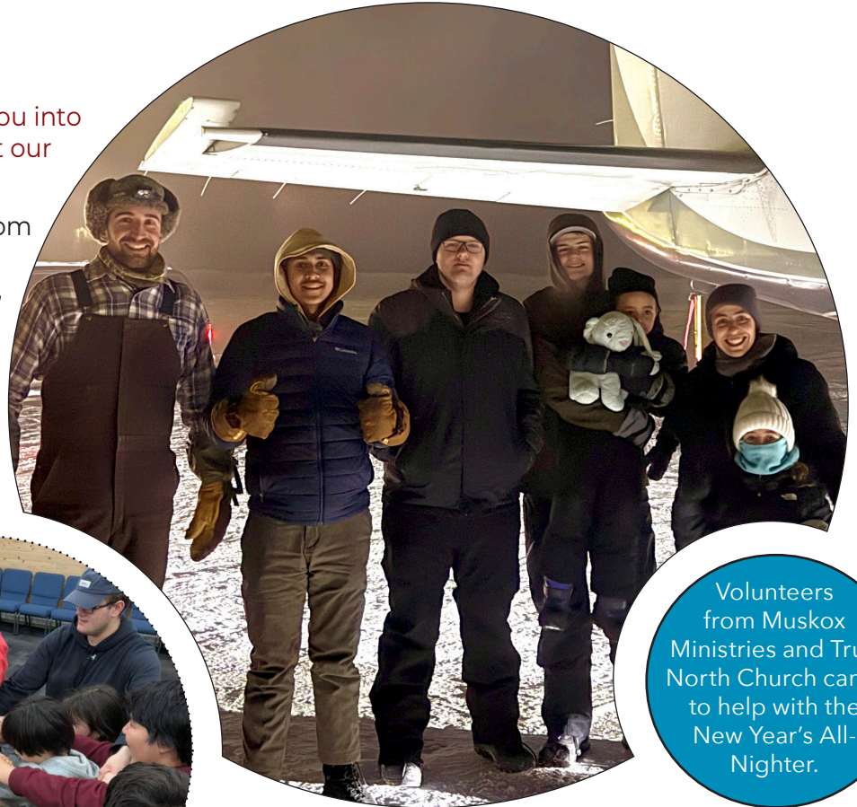
Volunteers from Muskox Ministries and True North Church came to help with the New Year's All-Nighter.

The past year has included many changes and challenges in our life and ministry. Some have been great, like and increase in church attendance, growth of the kids ministry, and more opportunities for ministry in villages around Fort Yukon. Some have been difficult, such as health issues with loved ones, deaths in the community, and new financial hurdles.