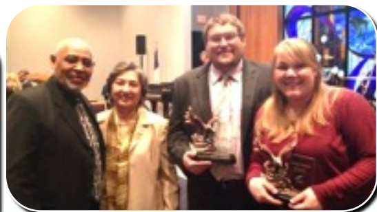
We were honored at the GO! launching ceremony